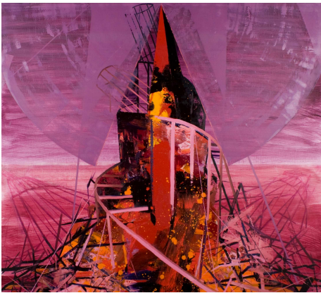
"Construct." 54" x 60", oil on canvas, 2008.